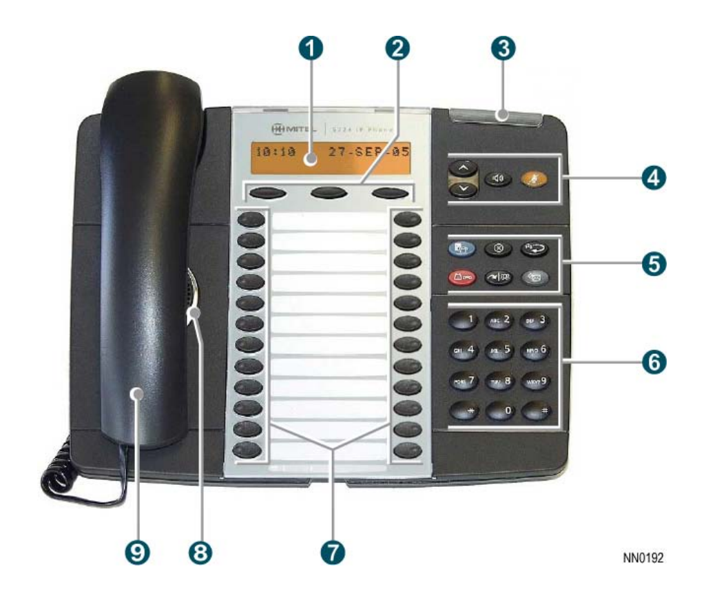
The 5224 IP Phone