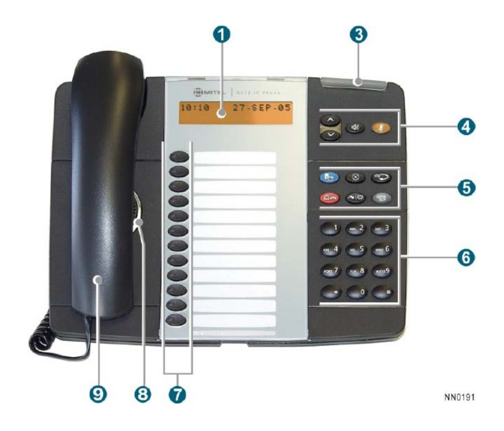
The 5212 IP Phone